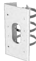
DS-1475ZJ-Y Vertical Pole Mount