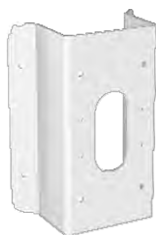
DS-1476ZJ-Y Corner Mount